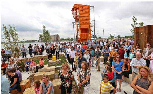
of the Harbor View Plaza grand opening.

The WaLUP calls for new waterfront parks that provide opportunities for people to connect to the water and recreate. In July 2019, with the support of many funders and partners, HDI opened Harbor View Plaza at the east end of Greenfield Avenue. This new $1.5 million waterfront park includes the District's first kayak launch, a water feature, a water play area, a shipping container play structure, and plenty of space to sit and watch the ships at Jones Island. Be sure to visit Harbor View Plaza for the full experience and learn more at harbordistrict.org/projects/harbor-view-plaza .