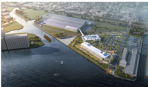
Rendering by Eppstein Uhen Architects showing Komatsu Mining Co's planned North American headquarters and manufacturing facility.

Environmental cleanup and remediation of the former Solvay Coke & Gas Co. site is underway and expected complete in early 2020. The site will be combined with the City-owned former coal storage site at 401 E. Greenfield Ave. for the future home of Komatsu Mining's North American headquarters and manufacturing facility. Construction on the $285 million development is expected to begin in spring 2020 and will house over 600 jobs when complete. The project includes 3/4 of a mile of new public Riverwalk along the waterfront, beginning at Harbor View Plaza and extending south to Kinnickinnic Ave. A public planning and design process for this Riverwalk section will begin in spring 2020.